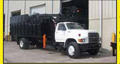
1996 Ford F-800, Diesel, Auto Trans, Petersen Lightning Loader, Riding Seat, Trash Grapple