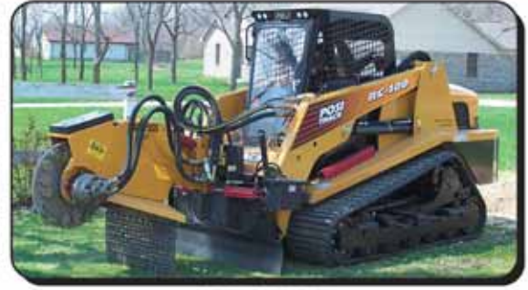
SKIDSTEER POWERFUL EFFECTIVE HYDRAULIC DRIVEN SKIDSTEER GRINDERS

• POWERFUL • PROVEN • PATENTED • PERFORMERS