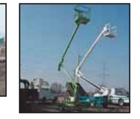
2) Pull Behind Manlifts 2) Eagle 1) 1998 Nifty Lift, Up to 47'+ W/R, Honda Gas $8,900 - $10,900

Delivery Available • Excavators Available • Pull-Behind Man Lifts Available • Some Financing Available