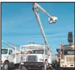
1999 Ford F-800 S/A Bucket Truck, 6 Speed, 60' W/R Lift-All, 39,000 Miles, Diesel, A/C, Air Brakes, $34,900