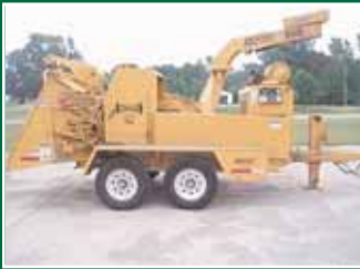
2006 Demonstrator - Cone Head 200 HP John Deere Engine - Winch - Hyd Jack - Hyd Swivel Discharge - Auto Feed & 34" Wide x 21" High Feed Sys. 2 Powerful Feed Rollers - Make Offer!