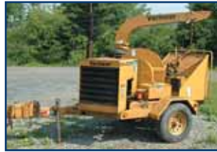
1999 Vermeer BC1230a 12" Hyd. Feed Chipper, Autofeed, 86 HP Perkins Diesel, Dealer Reconditioned, Only 1,300 Hours! $17,900