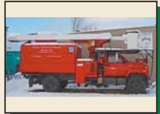
1995 GMC TOPKICK Altec LRIII 60' WH, ONLY 55K Miles! New Tires, Fully Reconditioned, New Paint, 11' Dump, Kubota Pony Motor, Cat Turbo Diesel, 6 Speed Manual, $37,500