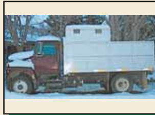
1995 Ford L-8000 6 Cyl. Ford Turbo Diesel, 198,400 Miles, Manual, 25,900 GVWR, Air Brakes, 28 Yd Elec. Dump, Removable 2-Section Top, $22,500