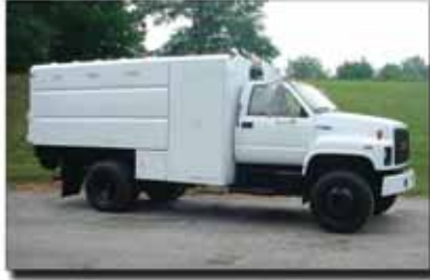
1997 GMC C5500, 366 FI Gas, 5 Speed, 11' Chip Body, Several To Choose From!