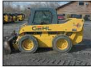
2003 Gehl 7800 Only 1,000 hours