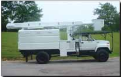
1998 GMC C7500, Altec LR III-55, 60' Working Height, 366 FI Gas, Pony Motor, Low Miles