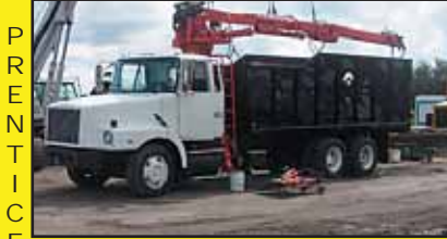
(3) 1998 Volvo Grapple, New Dump Body, Serco 8000 Loader