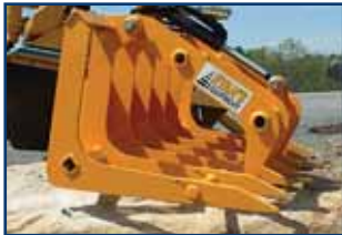
Mini Skidsteer Grapple Rake 42" Grapple Rake For Mini Skidsteers, New From Ryan's, Call!