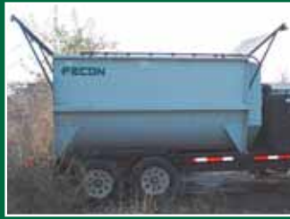
2001 Fecon Colorizer - Continuous Mix Machine - Will Process 200 Yds Per Hour 12,000# - 12 Yd Hopper - Runs an 80 HP - Machine Has Very, Very Few Hours - New Price $75,000 - Buy it for $45,000!