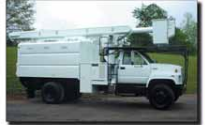
1997 GMC C7500, Altec LR III-55, 60' Working Height, 366 FI Gas, Pony Motor, 45,488 Miles