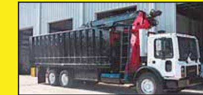
2000 Mack, Auto Trans, 24' Dump Body, Low Miles, Prentice 120C Log Loader