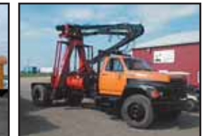
1996 Ford Apprentice F90 Clam Truck, Ford 8.2L Diesel, 5+2 Speed, 105,000 Miles, Runs, Drives & Works Good, Aux. Hyd Pintle Hitch, $24,900