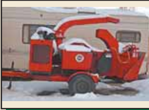
1994 Morbark Model 17 E/Z Beaver 116 HP Cummins 4 Cyl. Turbo, 17" Capacity, Hydraulic Feed Roller, Hydraulic Lift, 2,747 Hours, $14,900