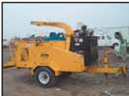
2000 Woodsman 2118 1,000 Hours, Woodsman 2012, 130 Hours, Cummins Diesel, $15,900 - $19,900 OBO Also: Dsl Drum Chippers, $6,500