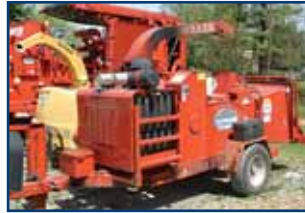
2004 Morbark 2400XL 18" Chipper, 125 HP Cat Diesel, Hyd. Front Stabilizer, Autofeed, Dealer Recond., Low Hours, $36,900