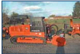
Fecon FTX 140 Forestry Mower 140 HP John Deere, Clear Those Overgrown Lots & Right Of Ways the Quick Way, Call!