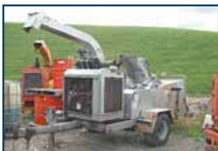
1998 Morbark 2400 18" Hyd. Feed Brush Chipper , John Deere Turbo Diesel, $19,900

New Location Now Open In The Philadelphia Area (215) 788-1476 • Hayes Blvd. • Bristol, PA Now Serving New Jersey With A Local Representative!