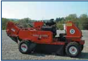
New Morbark Stump Grinders Both Gas & Diesel models In Stock Now! Widest Swing in the Industry, Easy Tooth Changes. Try One Today! Call!

Conveniently Located at Exit 232 (Buckhorn) I-80 in Bloomsburg, PA