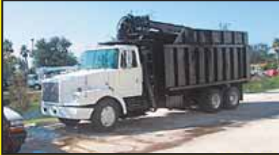
1996 Volvo, TIA, Tag Axle, Prentice 120