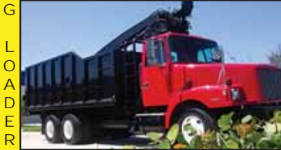
1998 Volvo Grapple Truck, New 20' Dump Body, Serco Log Loader, Low Miles, Ready to Work