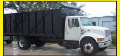
2000 IHC - 10 - Trash Dumps, New Body, Diesel, Auto