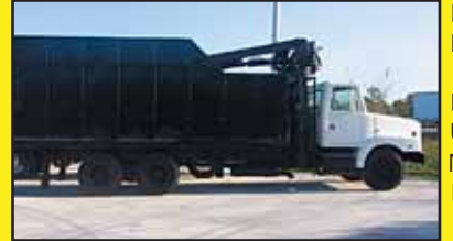
Let Andy's Truck Build You A Custom Log Loader To Your Specs!