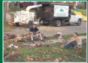
1994 Ford Diesel with Plow - 80,000 Miles - Nice Box - 1999 Woodchuck W/C 17 - 1,400 Hours - Gas Eng - $18,900 OBO