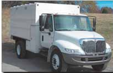
2006 INTL 4200, VT 365 Diesel, Auto, Non-CDL, 10,682 Miles, A/C & Radio