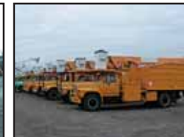
12) 1988-1994 Forestry Trucks Ford, All 55' Over Center, Teco, Altec, Versalift, Hi-Ranger, $14,900- $26,900