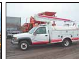
1997 Chevrolet 3500 4X4, Bucket Altec, Fiberglass Utility Boxes, Automatic, Diesel, Remote Spot Light, Directional Lights, Clean! $16,900 OBO