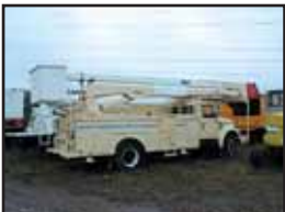
1990 International 70' W/R Teco, DT466, Auto, 53,000 Miles, Power Co. Owned, $38,900 Also: 1979 Chevy C70, 70' W/R Hi-Ranger, 8 Cyl, 5+2 Speed, $19,900

Check Out Our Full Inventory At: WWW.PETTITTRUCKS.COM