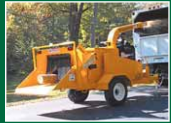
12X Woodsman Chipper - $34,900 Also: 18X Woodsman - Best 8,000# Chipper on the Market - 25" by 24" High Opening - 50% Fewer Moving Parts - Built to Last! $45,900