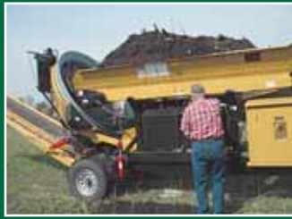
2006 Orbit Screen - Demo Model Priced at $ 52,000! Retails for $ 58,900