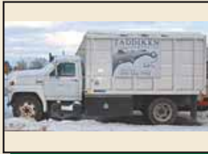
1991 Ford F-600 Ford Turbo Diesel, 6 Cylinder, Manual, 18 Yard Hydraulic Dump, 66,020 Miles, $15,900