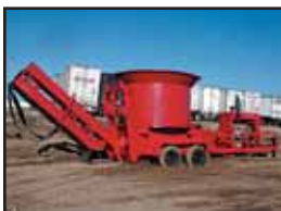
Tub Grinder Cummins Diesel, Discharge Conveyor, $24,900 Also Several Disc & Drum Chippers Available, Gas or Diesel, $4,500 - $11,900