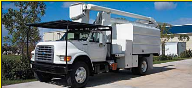
FORESTRY TRUCKS! We Have 2000 & 2001 Ford F650s, IHC 4700s, Freightliner FL60s, All Under CDL, Diesel Engines, Auto Trans, PS, A/C, Cab Guards, Altec LRV50 Booms, Chipper Dump Bodies, Tool Boxes, Low Miles, Call Capt Ron for a Quote!

WE SPECIALIZE IN GRAPPLE TRUCKS, CHIPPER & TRASH DUMPS!