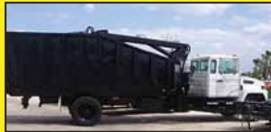
2000 Mack Grapple, Petersen Lightning Loader, 58,000 Miles, 3 To Choose From!!!