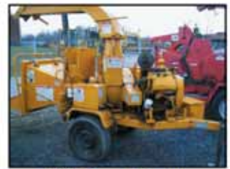
1992 Brush Bandit Willing to make a deal!