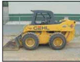
2002 Gehl 7800 Just over 2,000 hours