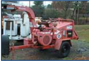
1998 Morbark 2070 Chipper 7" Hyd. Feed Chipper, 65 HP Wisconsin Gas Engine, Only 350 Hours, Excellent Condition! $11,995