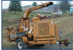
Bandit 200+XP 12" Hydraulic Feed Chipper, Hyd Lift Cylinder, Cummins Diesel, Only 800 Hours! $17,900