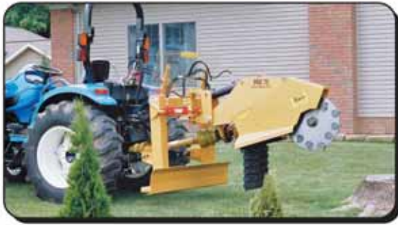
TRACTOR PROFESSIONAL GRADE PTO DRIVEN TRACTOR GRINDERS