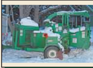
2001 Brush Bandit 254XP 14" Capacity (Will Take 15") 983 Hours, 125 HP John Deere, $19,900