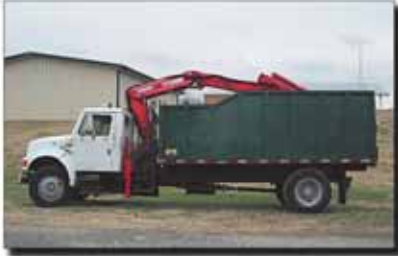
1999 INTL 4700, Fassi FS.3 Grapple Truck, DT 466 Diesel, Air Brakes

We're Customer Friendly! Call Us For New Or Used Equipment