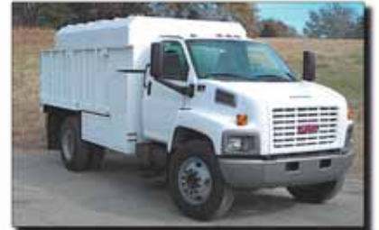
New 2006 GMC UTV, C7 CAT Diesel, Non-CDL, Removable Top & Sides