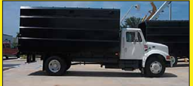
All Have New Paint, C & C & Chipper Dumps or Can Be Painted to Your Specs! Bodies: 16' Long, 7 1/2' High, 8' Wide, 30 Yard Capacity, Heavy Gauge Steel Construction, Vented On Top, Single Telescopic Hoist & PTO Drives!

Go To: www.andystruckcenter.com Many More To Choose From!!!