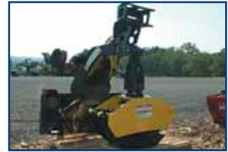
New Implemax Grapples IMX Grapples Now In Stock, Hydraulic Rotation & Winch. Skidsteer Mount. Fastest Way to Feed a Chipper, Call!