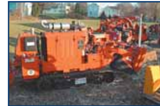
New Morbark D86SP Track Stump Grinder 86HP CAT, Tracks Go Thru a 36" Gate, Remote Control & Blade. Demo One Today! Call!