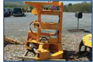
New Ryan's Tree Shear 14" Tree Shear Attachment for Skidsteer or Track Loader, Call!