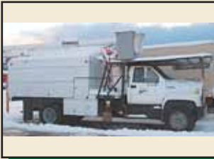
1990 GMC TOPKICK 55' WH Aerial Lift of Connecticut, Cat Turbo Diesel, Automatic, 11' Dump, 79,580 Miles, $24,900