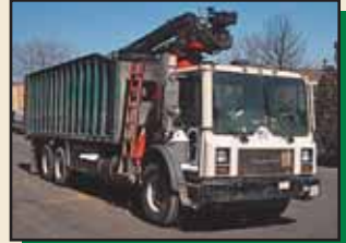
1998 Mack Cabover Mack Turbo Diesel, 6 Cylinder, Automatic, Tandem Axle, 52,000 GVWR, 24' Dump, 7'x8'x24' 45 Cu/Yds, Prentice 120 Grapple, $99,900