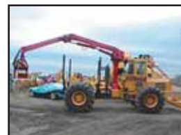
2) Tree Farmer Log Skidders C5D Forwarder & C4D Shortwood, $21,900 - $23,900