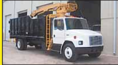
2000 Freightliner FL70 Serco Log Loader, 18' Dump Body, Priced To Sell!