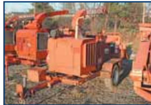
2001 Morbark 2070XL Chipper 10" Hyd Feed Chipper, Perkins Diesel, Low Hours, Dealer Reconditioned, $17,900