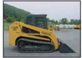
2003 Gehl CTL80 Excellent Condition