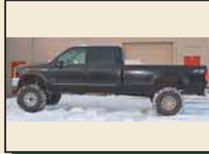
2000 Ford F-250 80,000 Miles, 7.3 Power Stroke Turbo Diesel, 4 Door, 8' Bed, 8" Skyjacker Lift, 38" Interco Tires, Class 4 Hitch Receiver w/Pintle Hitch (2" Ball), 6 Speed, $23,000