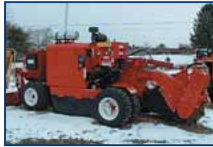
New Morbark D76SP New 4WD Self-Propelled Stump Cutter, 62 HP Cat Diesel, Blade and Remote Control, Many New Features, POR