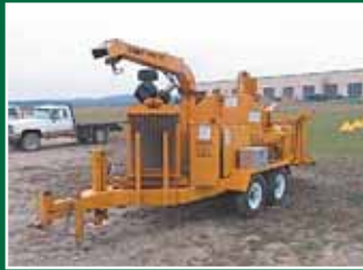
1998 Bandit 280XP - 200 HP Cummins - Tandem Axle - Completely Refurbished in 2005 - $23,500 OBO