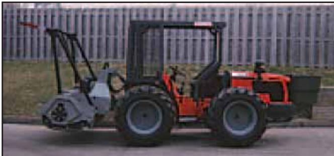
2001 Antonio Carraro Tractor TRX 9400, 4X4, 87 HP PTO, 394 Hours, Hi-Lo Option, 4 Cylinder VM Detroit Diesel, Caged for Forestry Work, 2003 FAE Shredder Model FML-S 175, Brown 672 Brush Hog w/Dual Tail Wheels, Pro 75 Miller PTO Stump Grinder, Price $48,500 OBO