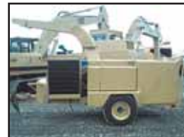
Vermeer BC1800 6,200 Hours, Rebuilt Cummins Turbo Diesel, $19,900 OBO Also: Vermeer 1250 Curbside Feed, 1998 Vermeer 1230 Gas, Bandit 200, Bandit 200+ Gas, $8,500 - $11,900