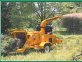
730X Woodsman, Best 4,500# Chipper on the Market - 18" by 13" High Opening - 50% Fewer Moving Parts - Powder Coat Paint - Built To Last! $26,000