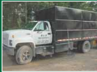
1988 Ford F-700 - Diesel - 18' Chip Dump with Roof - 100,000 Miles - 5 Speed / 2 Speed Overdrive - $6,700