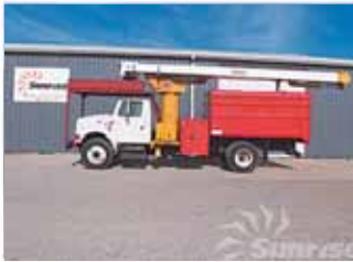
1999 International 4700 with Versalift mode VO55RVW 60' working height aerial lift and 11' chip/dump box. Only 34,969 miles. SR3064