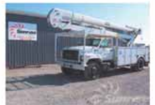
2001 International, CAT diesel, 47,591 miles, Allison auto, 60' material handling boom, awesome truck! SR7012