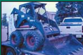
Bobcat 773 Skid Steer 46 HP Kubota, 1,669 Hrs, $11,800 EU