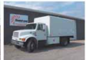
2000 International, under CDL, DT466 diesel, Allison Auto, brand new 14' extra-high body & underbody toolboxes. Also available with "L" toolboxes. Ready for work! SR2888

..... MANY MORE UNITS AVAILABLE, JUST GIVE US A CALL!!