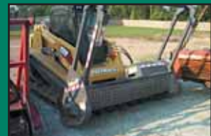
Timber Ax 73AXH Brush Clearer , 30 Hrs. Attachment Only, $15,000 FI