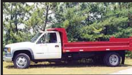
1995 Chevy HD, 6.5 Diesel, Automatic, 15,000 GVW, 12' Dump Body w/Fold Down Sides, Pintle Hook...$13,500