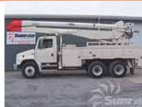
2000 Freightliner FL80, CAT 3126 diesel, 88,836 miles. 60' Altec AA7555L material handler. SR3068