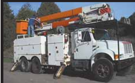
1990 International 4900, DT-466, Automatic, Tandem,, 54,000 GVW, Posi-Plus 55' Over Center Double Bucket (Can Be Made Single) Material Handling Jib with Rope Winch, Brush Guard...$16,500