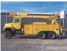
1990 Ford, big 4 x 6 truck with 75' material handling elevator. Super capable truck. Has 270 HP diesel