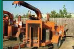
Brush Bandit 250XP Brush Chipper , 3 Avail. w/115 HP Cummins, $Call For Price AU