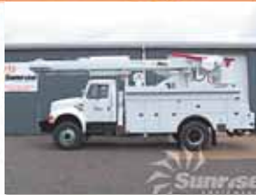
1994 International 4 x 4, 250 HP DT466, only 49,258 miles! 55' Altec rear mount with material handler. Could be a flatbed. SR2992