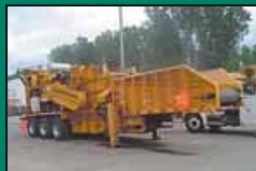
CBI Magnum Force 4000 Horizontal Grinder 880 HP, 3,963 Hours, $260,000 MI