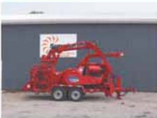
2001 Morbark Hurricane chipper. Just reconditioned, and in great shape. Big 260 HP 8.3L Cummins diesel & Morlift 150 grapple can handle the tough lot clearing jobs. Hydraulic shoot & jack. Save $35k off new. SR2844

LOOKING FOR A GOOD USED CHIPPER? NO PROBLEM! CHECK OUT OUR FOLLOWING SELECTION. KEEP IN MIND THAT ALL OF OUR USED CHIPPERS ARE INSPECTED AND SERVICED BEFORE DELIVERY FOR YOUR PEACE OF MIND.