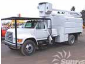
1998 Ford F800 with 55 ft Altec LB 650A aerial lift. 5.9L Cummins turbo diesel, standard transmission, dumping chip box forestry package, runs & operates like new. Nice truck with only 60,382 miles! SR2559