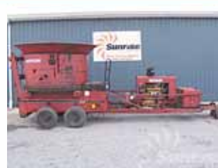
Nice regrinding tub grinder. John Deere diesel power & good output capacity; outfeed conveyor IS INCLUDED but not pictured. Unit is serviced and ready to work- repainting service would be an option if requested. SR3033