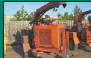
Brush Bandit 250XP Brush Chipper , 3 Avail. w/115 HP Cummins, $Call For Price AU