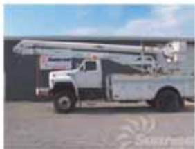
1994 Ford 4 x 4 Cummins diesel with 112,825 miles, big 60' Altec bucket. Could be a flatbed. S 2851