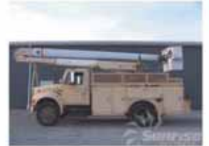
1995 International, diesel, 50' rear mount Telelect boom. Nice short wheelbase truck, priced to sell. SR2887