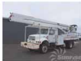
1999 International 4 x 4, Allison automatic, flatbed, 70' Teco bucket, front bumper winch, cab protector,