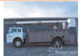
1990 Ford, 250 HP CAT diesel, 104,054 miles. Big Altec 60' rear mount, could be a flatbed. Nice aerial truck priced to sell. SR2951