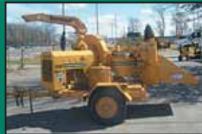
BC1250 12" Brush Chipper Rebuilt 80 HP Perkins, 538 Hours, $21,450 CH