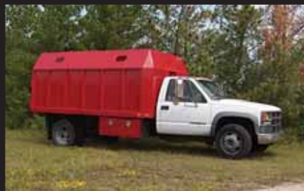
2000 Chevy 3500HD, 6.2 Diesel, Automatic, 15,000 GVW, New 12' Chip Body, Barn Doors, Pintle Hook, Light Plug, 2 Toolboxes, 90,000 Miles, Excellent Condition...$17,500