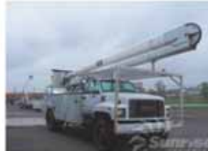
1999 GMC 7500, CAT diesel, auto, 60' rear mount High Ranger, only 35,006 miles. Could be a flatbed too. Excellent shape. SR2952