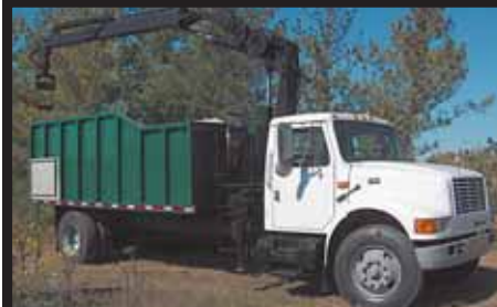
2001 International 4900, DT-466, 6+1 Speed, 33,000 GVW, Airbrakes, HIAB 140 Knuckleboom, Upright Controls, New Grapple, New 16' Brush Body Dump, Excellent Truck...$58,000