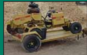
Rayco RG1625 Super JR Stump Cutter w/Trailer, 25 HP Kohler, 210 Hrs., $8,750 MI