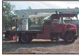
RBG Unit #1023 1989 Ford L7000, Diesel, 17,000 Original Miles, RM Versalift VO50, $34,900