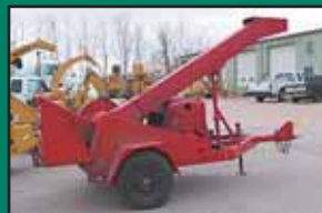
Asplundh Brush Chipper 300 HP Ford Gas, $4,500 CH