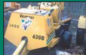
SC630b Stump Cutter 35 HP Wisconsin Gas Engine, $10,000 AU