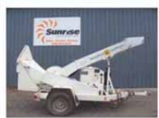
1998 Altec Whisper chipper, great condition, low hours, ready to go. This is a nice, reliable late model chipper perfect for the light trimming crew or start up & part time company. SR2964