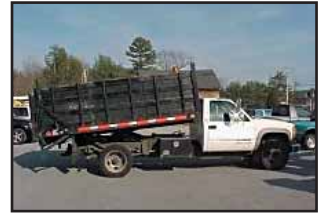
RBG Unit #EL1012 1994 GMC 3500HD, Gas, Auto, 115K Miles, 12' Rack / Dump w/Lift Gate, $6,500