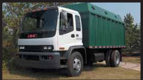
1998 GMC T-8500, CAT Diesel, 6 Speed, 33,000 GVW, Air Brakes, New 16' (30 Yards) Chipbody Dump, Pintle Hook, Light Plug...$29,500