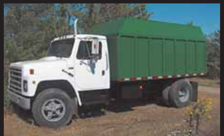
1988 International, Diesel, 5+2 Speed Rear, 26,000 GVW, Hydraulic Brake, New Clutch & King Pins, 14' Chip Body Dump, Pintle Hook, Light Plug, Great Truck...$14,500