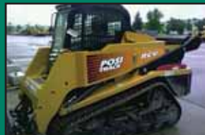
RCV Skid Steers 3 Demo Units Available $Call for Price AU