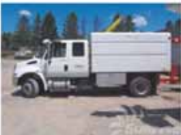
2006 International Ext Cab, Lo Pro, under CDL, DT466 diesel, Allison Auto, loaded chassis, 11' body, awesome truck! SR2744

NO ONE BUILDS A BETTER CHIP TRUCK. WE NOW USE BRAND NEW BODY PACKAGES, WHICH INCLUDE NEW HYDRAULICS & HOISTS! MANY SIZES TO CHOOSE FROM: 9' - 11' - 12' - 14' - 16'. TAKE YOUR PICK OF TOOLBOXES, TOO! UNDERBODY OR "L" BOX CUTOUTS, ALUMINUM OR PAINTED. WE ARE CURRENTLY BUILDING SINGLE AXLE TRUCKS UP TO 34 CUBIC YARDS, AND ALL BODIES CARRY A THREE YEAR ARBORTECH WARRANTY. WE CAN BUILD YOUR TRUCK WITH A USED OR NEW CHASSIS - YOUR CHOICE OF BRAND TOO! GIVE US A CALL AND GET WHAT YOU WANT TODAY!