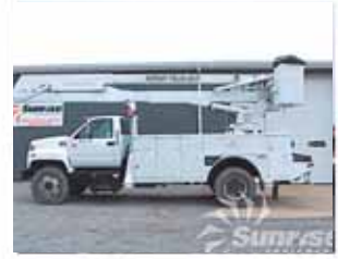
1997 GMC C7500 CAT3116 engine, air brakes, mounted with 1989 Simon-Telelect T5055 60' working height aerial bucket, only 36,394 miles. SR3060

NO ONE BUILDS A BETTER CHIP TRUCK. WE NOW USE BRAND NEW BODY PACKAGES, WHICH INCLUDE NEW HYDRAULICS & HOISTS! MANY SIZES TO CHOOSE FROM: 9' - 11' - 12' - 14' - 16'. TAKE YOUR PICK OF TOOLBOXES, TOO! UNDERBODY OR "L" BOX CUTOUTS, ALUMINUM OR PAINTED. WE ARE CURRENTLY BUILDING SINGLE AXLE TRUCKS UP TO 34 CUBIC YARDS, AND ALL BODIES CARRY A THREE YEAR ARBORTECH WARRANTY. WE CAN BUILD YOUR TRUCK WITH A USED OR NEW CHASSIS - YOUR CHOICE OF BRAND TOO! GIVE US A CALL AND GET WHAT YOU WANT TODAY!