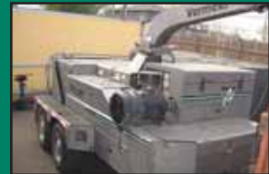
BC2000 20" Brush Chipper , 200 HP Engine, 2,295 Hrs., $34,500 AU