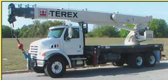
TEREX Stinger Cranes 14 - 35 Ton on F750/LT7501

800-683-5438 SALES/SERVICE/PARTS/RENTAL/FINANCING