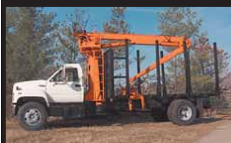
1996 GMC Topkick, CAT 3126 Diesel, 6 Speed, 30,000 GVW, Hydraulic Brakes, SERCO 8000 Loader Continuous Rotation Grapple & Clam, Log Bunks, Pintle Hook...$36,000