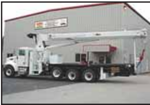
NEW DEMO FOR SALE! 2007 Peterbilt 335, 6x4, ALTEC 26 Ton 103ft Crane, In Stock, Call for Info!