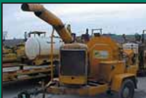
Badger TM40 Brush Chipper 6 Cyl. Ford Gas, $4,500 EU