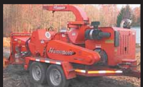
2003 Morbark Chipper Model 2400, 180 HP CAT, 420 Hours, Auto Reverse, Excellent Shape...$43,500