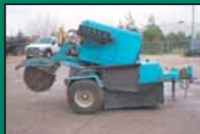
SC1102 Stump Cutter 110 HP Cummins Engine, 1,300 Hours, $21,000 AU