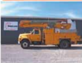
1997 Ford, diesel automatic. 52' Holan rear mount with material handler. Great shape, can be a flatbed! SR2993

WE HAVE PLENTY OF BUCKET TRUCKS IN STOCK TO FIT YOUR NEEDS - WE CAN CUSTOM BUILD OR MODIFY ANY TRUCK FOR YOU. ANY OF THE FOLLOWING UNITS ARE GREAT TRUCKS THE WAY THEY ARE, OR CAN BE CUSTOM MODIFIED: FLATBED CONVERSIONS, CHIP BODY INSTALLS, CUSTOM BODIES, CUSTOM PAINT . . . YOU'RE IN CHARGE! PICK ONE OUT AND GIVE US A CALL, AND LET US DO IT THE WAY YOU WANT IT! OF COURSE, ANNUAL AND DIELECTRIC INSPECTIONS & CERTIFICATIONS ARE ALWAYS AVAILABLE ON ALL OF OUR TRUCKS.