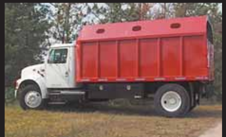
2001 International 4700, DT-466, Automatic, 25,000 GVW, Non-CDL, Air Brakes, New 14' Chip Body Dump, Pintle Hook, Light Plug, Excellent Truck...$35,000 ($770/Mo. w/Approved Credit, Applicable Tax, Title, & Ins.)