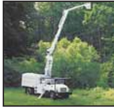
New 2006 Chevy C7500 ALTEC 75' Forestry, In Stock ~ Ready For Delivery! Call for Info!