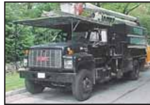
RBG Unit #BL-5153 1994 GMC Topkick, Gas, Kubota, ALC AL50 55ft Working Height, $27,000