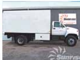
2000 Chevrolet C7500, new 16' Arbortech dumping chip body & hoist. Cat 3126 diesel engine, 6 speed manual transmission & 2 speed axle, huge 34 cu. yd capacity. Only 55,087 miles, great truck! SR2960