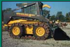
New Holland LS190 Skid Steer 92 Hours, $34,500 FI