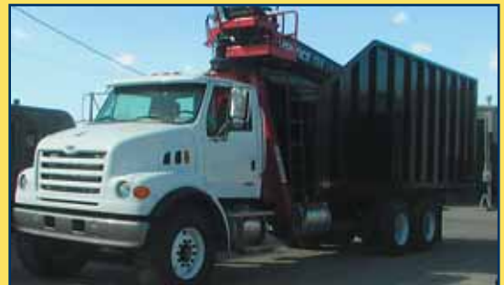
Prentice 124 Self Loaders

TEREX/JCB/PETTIBONE/ BRODERSON/PRENTICE/ TIREBOSS/BSG/USTC BLOCK CRANES