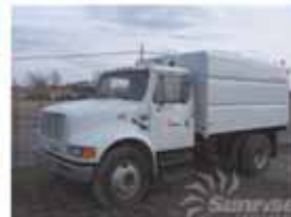
1995 International, under CDL, 230 HP DT466 diesel, 5-spd/2-spd, 11' body with equipment ramps, just reconditioned! SR2526, $29,995