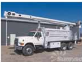
1998 Ford F900, big 8.3 Cummins diesel & Allison automatic, towering 97' Altec double elevator. Just reconitioned-WOW! SR 2740