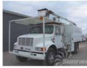
1993 International under CDL forestry truck. Just cleaned up and serviced. New parts installed, and fresh inspection & certification given. Ready to go now. SR2908