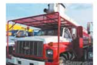
1992 Chevy Kodiak, 83,291 miles, 55' Asplundh, pony motor, runs well. Nice looking truck recently traded-in. Work ready and priced to sell! SR3036