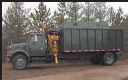
2001 International 4700, DT-466, Automatic, Hydraulic Brakes, Non-CDL, 26,000 GVW, SKB Ride on Boom, Grapple Folds Behind Cab, 14' Chip Body Dump w/Removable Roof...$56,000 ($1,208/Mo. w/Approved Credit, Applicable Tax, Title & Ins.)