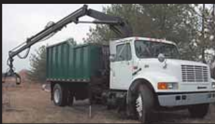
2001 International 4700, DT-466, Automatic, A/C, HIAB 070 Knuckleboom w/New Continuous Rotation Grapple, Upright Controls, New 14' Brush Body...$52,000 ($1,125/Mo. w/Approved Credit, Applicable Tax, Title & Ins.)