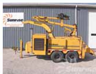
Big 20" chipping capacity with this well maintained Vermeer BC2000 w/ loader. Cummins diesel power. Unit has just been serviced and is ready to work. Save thousands off of new. SR3053