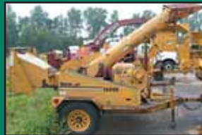
BC1600a 16" Brush Chipper 300 Ford Gas Engine, 3,762 Hours, $6,500 CH