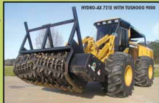
HYDRO-AX 721E WITH TUSHOGG 9000

Visit us on the web for complete product information