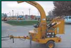
BC625a 6" Brush Chipper 25 HP Kohler, 777 Hours, $8,750 CH