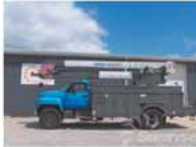
1993 GMC Topkick, CAT diesel, 78,901 miles, heavy duty 54' Simon Telelect material handling boom. Could be a flatbed. SR2949