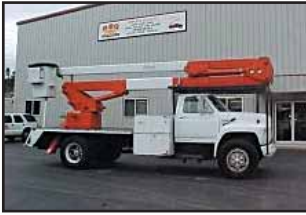
RBG Unit #OT-9287 1991 Ford Rear Mount, Diesel Engine, Auto, 95K Miles, 57' Working Height, $23,500

www.raymondbucketguys.com • Your New England Bucket Truck Connection!!