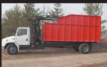
2000 Freightliner FL-80, CAT Diesel, 6 Speed, 33,000 GVW, Air Brakes, HIAB 140 Knuckleboom, Top Seat Controls, New 55" Grapple, New 17' Brush Body (35 Yd), Full Height Doors, Locking Rear End...$56,000