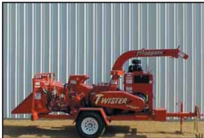
2006 Morbark Twister 12 86 HP Cat diesel