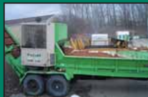
Fecon MZA 2500 Horizontal Grinder , 250 HP Cummins 2,500 Hrs, $65,900 MI