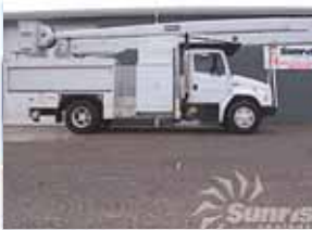
1993 Freightliner FL70, Cummins 5.9L diesel, only 38,493 miles! 65' Hi-Ranger 6H-60PBI bucket. SR3067