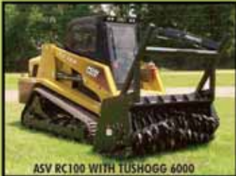
ASV RC100 WITH TUSHOGG 6000

TUSHOGG MEANS TOUGH Low RPM, Hi Torque, Less Dust