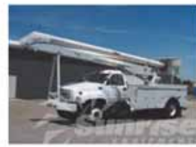
1998 GMC 7500, CAT diesel, Allison auto, 60' Altec, nice unit! SR2607