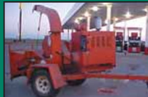
Morbark Eager Beaver Brush Chipper , 76 HP Cummins 1,400 Hours, $7,500 EU