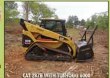
CAT 287B WITH TUSHOGG 6000

TUSHOGG MEANS TOUGH Low RPM, Hi Torque, Less Dust