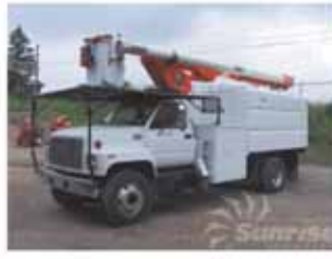
1997 GMC Topkick that has just been reconditioned. Beautiful truck with just 75,722 miles. Many new parts and a fresh certification, in addition to the paint job! SR2738