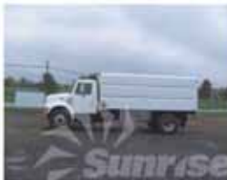
2000 International, under CDL, T444 diesel, Allison Auto, Lo Pro 16' chip body, big underbody toolboxes, just reconditioned! SR2622