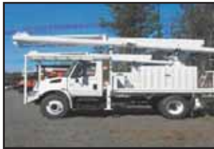
2007 International 7300, 4x4, Rear Mounted Altec 75'. Accepting Deposits for Feb - March Delivery!