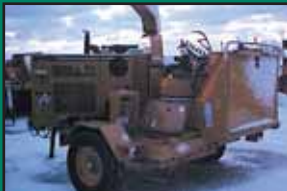
BC1250a 12" Brush Chipper 110 HP Rebuilt Perkins, 2,193 Hours, $18,900 EU